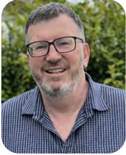
TENA KOUTOU MATUA MA

Welcome to 2025 at Rodney College! The year is well underway, and it has been great to see students settling into routines, getting stuck into their learning, and making the most of what's on offer.